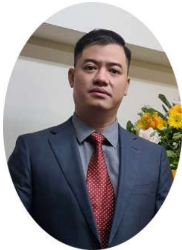
Do Vu Hoang - President - 1981